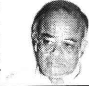
M. Bharadwaj page

Sastry's demonstrated a good knack of things.